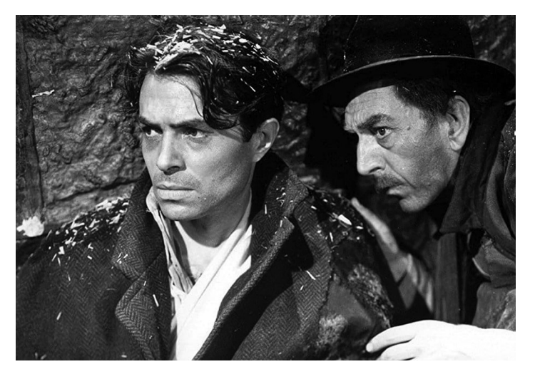
Monday 11 March at 6:15 pm