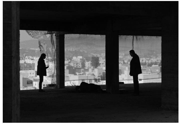
Tuesday 29 October at 6:15 pm