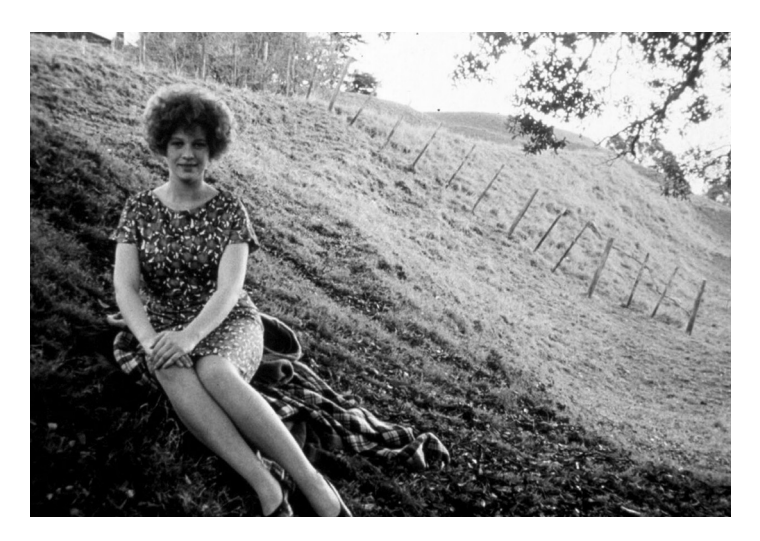
Monday 10 June at 6:00 pm