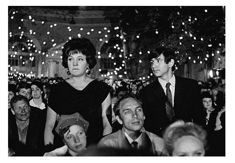
Monday 08 July at 6:15 pm