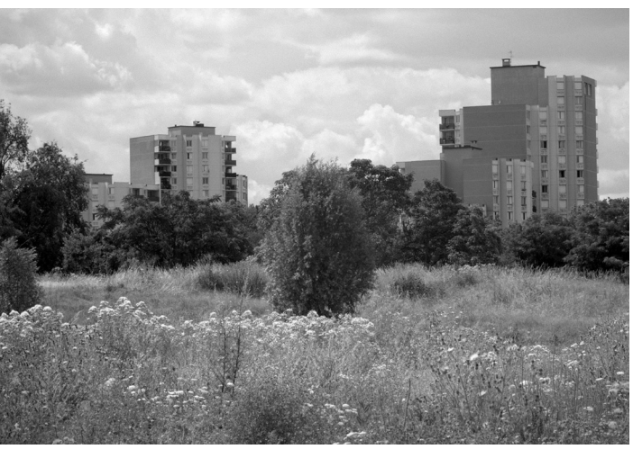
Monday 30 September at 6:15 pm

From its hypnotic opening moments – aided in no small part by the contributions from cinematographer Bruno Nuytten (which now look better than ever, albeit in a largely grey and grimy manner) and composer Andrzej Korzyński – to its absolutely terrifying final moments, Possession is a singular work of art that, now seen in its intended form, deserves consideration as one of the supreme horror films of its era. That said, for all of its grisly goings-on (and there are a lot), this is more of an exercise of emotional horror and on that level, it's absolutely devastating. Possession is one of those films you will either love or hate, but which you will never ever forget, no matter how much some of you may wish that you could. – Peter Sobczynski, RogerEbert.com