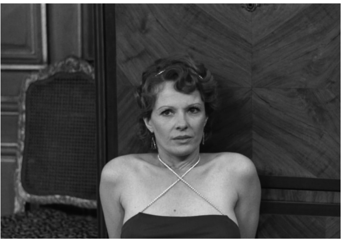
Monday 02 September at 6:15 pm