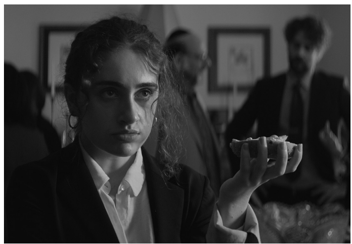
Monday 17 June at 6:15 pm

It is remarkable for its attention to detail, for its pure, striking and resonant images, and for its understanding of the full weight and value of human idiosyncracy. I mean to go and see it again as soon as I can. When it was over I felt an almost overwhelming urge to stand in the street and pull passers-by into the next show by main force. Only thoughts of this journal's good name restrained me. – Hilary Mantel, Spectator