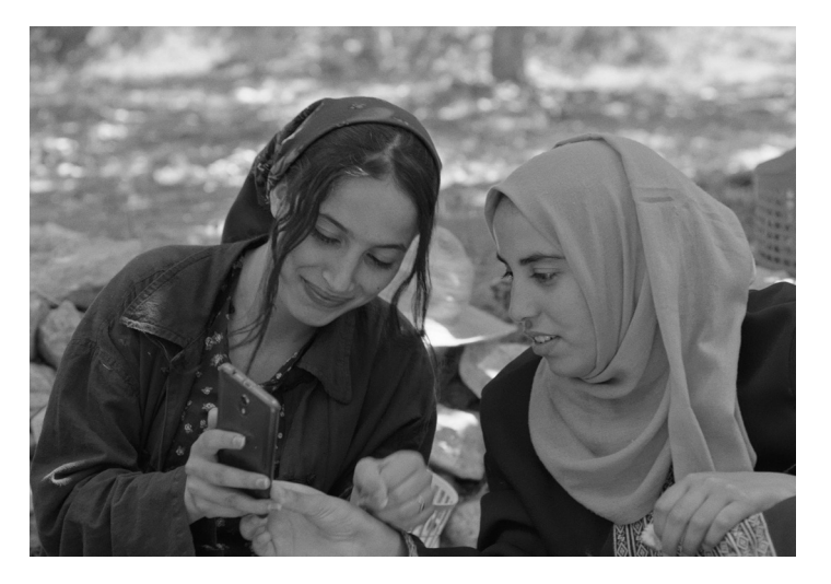
Monday 09 September at 6:15 pm