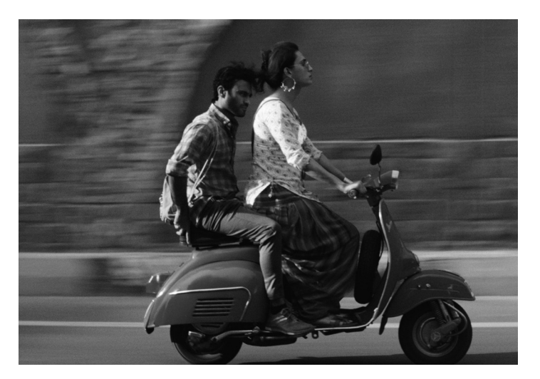
Monday 04 November at 6:15 pm