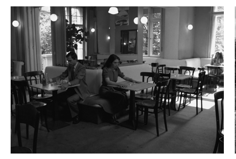
Monday 23 September at 6:15 pm