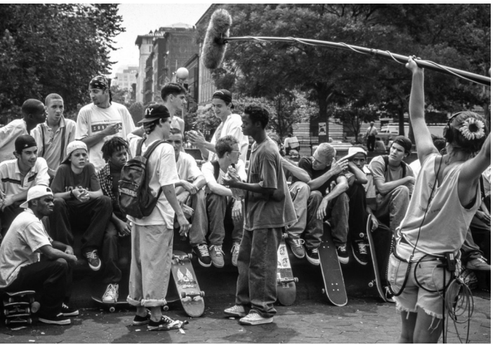
Monday 14 October at 6:15 pm

The camera often stays disturbingly close on faces, creating a nervous tension echoed in the editing. The tremendous energy that can be generated by hiphop at full volume is on display in a climactic group dance on stage... Deborah Young, Hollywood Reporter