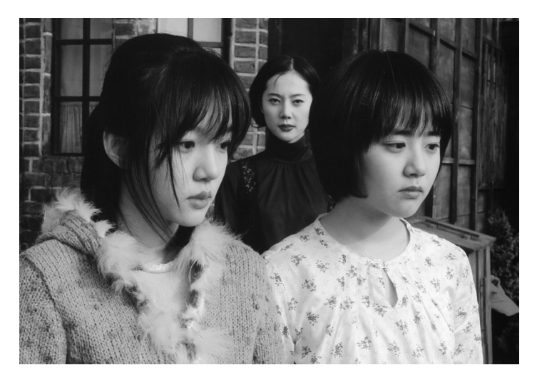
Monday 22 April at 6:15 pm