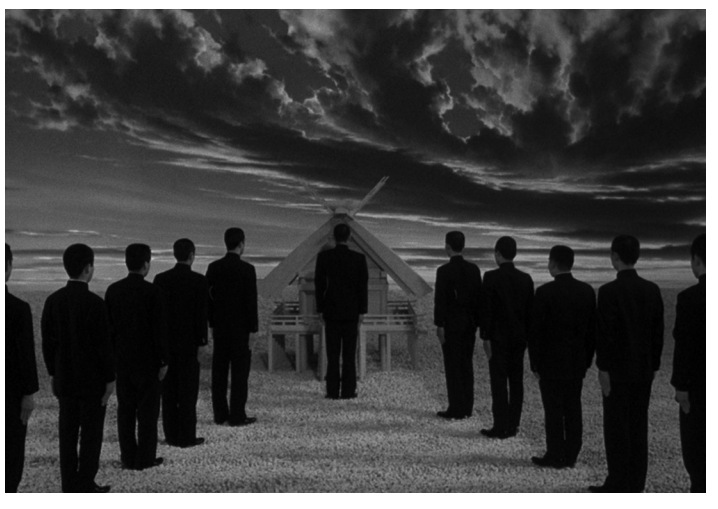
Monday 15 April at 6:15 pm