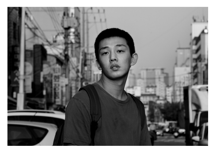
Monday 06 May at 6:00 pm