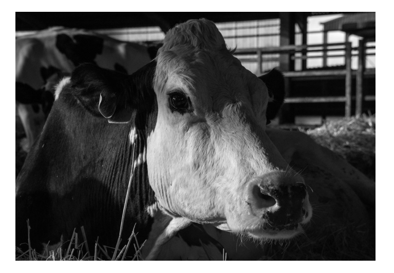
Monday 26 August at 6:15 pm