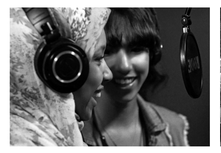
Monday 07 October at 6:15 pm