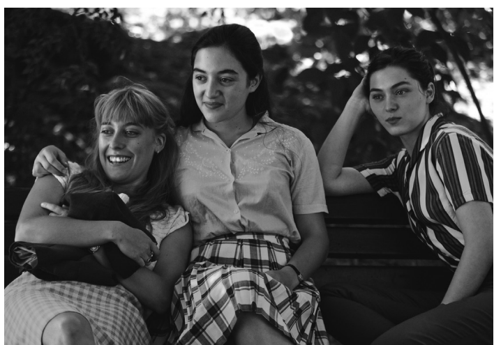
Monday 13 May at 6:15 pm