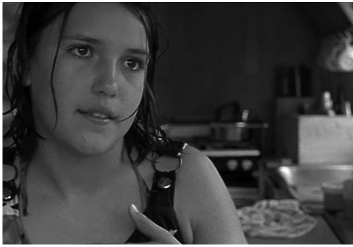
Monday 29 April at 6:15 pm

There are, towards the end, revelations that, at one level, clarify what has gone before, explain the nature of some of the horrors and past events. They make it clear that this is a carefully structured film about grief and guilt, as well as horror. They don't resolve every disturbing moment or confusing element: they leave some questions hauntingly unanswered. – Philippa Hawker, SMH