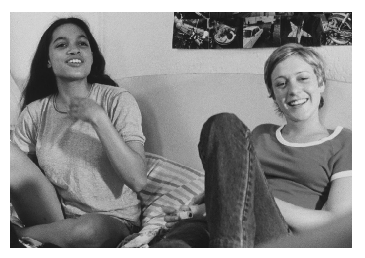
Monday 21 October at 6:15 pm