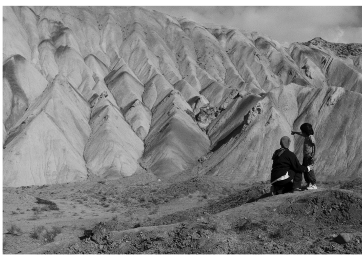
Tuesday 02 April at 6:15 pm

Slowly, Bong makes the critical connection between these people and the repressive society they live in - one where violence is commonplace and where the very nature of reality is constantly in dispute. Toward the end, the questions being asked of witnesses and suspects start to feel more existential than specific – as if, as the cops get closer and closer to the facts, the less certain everything becomes. By the time the spellbinding and mysterious final shot rolls around, we're left with this thought, the sad, mad truth of an authoritarian world: Nobody's innocent, and everybody's a victim. – Bilge Ebiri, Village Voice