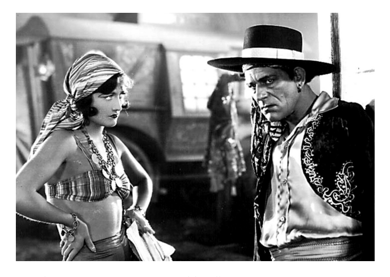
Monday 20 May at 6:00 pm - Double Bill