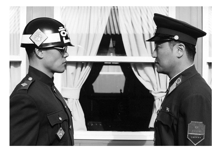
Monday 08 April at 6:15 pm