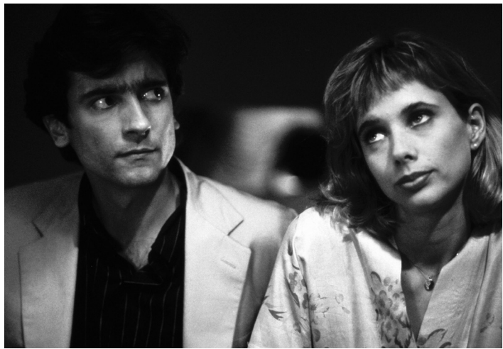
Monday 04 March at 6:15 pm

Please be considerate of others in the audience during film screenings.