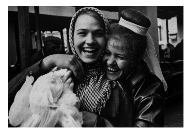
Monday 24 June at 6:15 pm