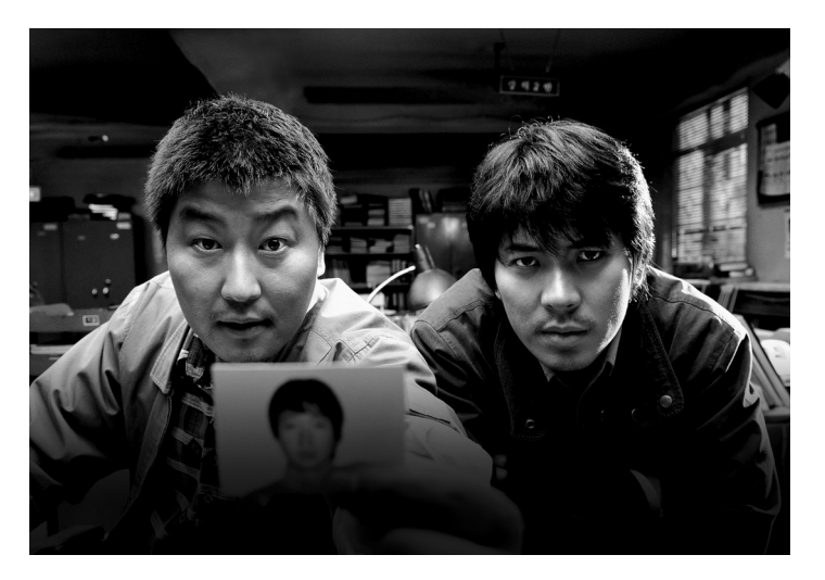
Monday 25 March at 6:00 pm