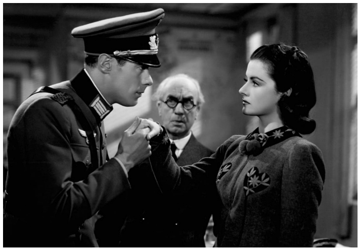
Monday 11 November at 6:15 pm